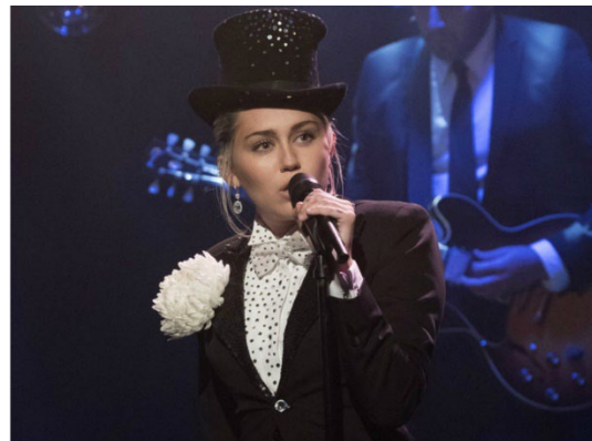
Figure 4 Maya and Marty 2016 (Portman, 2016)

Miley Cyrus was invited to perform on the stand-up comedy show Maya and Marty . The 2016 comedy show blends comedy sketches, musical performances, and celebrity guests into their show. Cyrus was performing a cover version of the classics I'm Your Man by Leonard Cohen and I'm a woman by Peggy Lee.