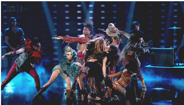
Figure 2 Britain's Got Talent (Gotty, 2010).

Cyrus embodies the song's theme through her dynamic and provocative choreography. She engages in energetic dancing and grinding movements with her backup dancers. Midway through the performance, she pulls one of the female dancers close, creating the appearance of simulating a kiss. The lyrics suggest Miley is not letting anyone prevent her from pursuing her desires. Similar to the TCA performance, the Britain's Got Talent performance drew some controversy. The media reported on the outrage of Miley supposedly 'making out' with a girl. This is seen in the news headlines at the time (Daily Mail, 2010). The controversy, rooted in homophobia, was based on one flash second of a simulated lesbian kiss, causing such a public reaction.