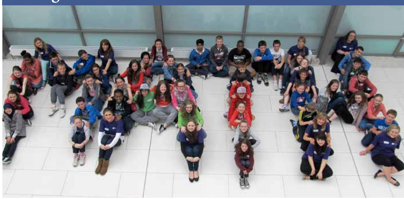
Sixth class primary pupils at the School of Education's four-day Maths Summer Camp spell out their new favourite subject. Later, the School of Mathematics celebrated Maths Week in October with a week of activities and workshops for school children.