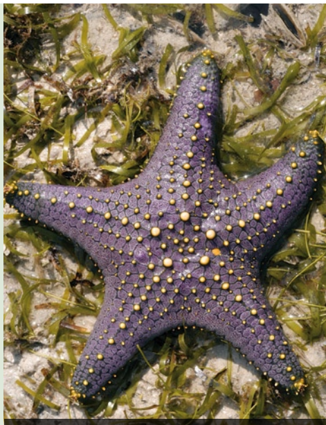
The Common Knobbed Star(Pentaceraster mammillatus) and the seagrass Thalassia hemprichii. Zanzibar, Indian Ocean © M.D. Guiry/AlgaeBase.

Professor Guiry's forthcoming book, A Catalogue of Irish Seaweeds, will show that 7.5% of all seaweeds occurs in Ireland, which is extraordinary for the size and geographical spread of the island, and contrasts strongly with our native flowering-plants, which amount to no more than 0.25% of the world's 350,000-400,000 species.