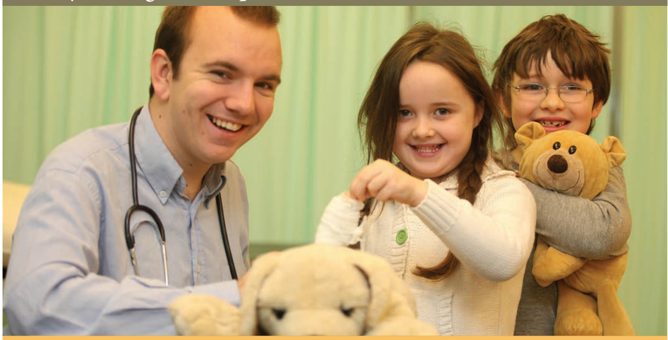
Over 1,500 schoolchildren brought their sick teddies to the 8th annual Teddy Bear Hospital at NUI Galway. The ever popular event is organised by the Sláinte Society, the NUI Galway branch of the International Federation of Medical Students Associations, and up to 200 medical and science students from the University.