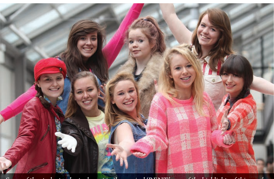
Some of the students who took part in the musical 'RENT', one of the highlights of this year's Múscailt festival.

February saw a feast of art, music, performance, dance, literature and film hit NUI Galway during the 13th annual Múscailt Festival. Highlights from the week-long festival included Galway University Musical Society's version of the musical 'RENT', a number of exclusive theatre performances, an award-winning clown show, and exhibitions of photography and art around the campus.