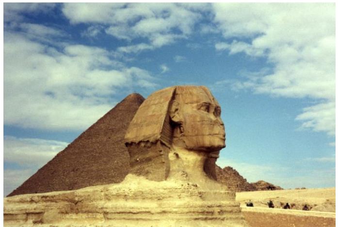
Sphynx and pyramid at Giza, Egypt

As early as the 4th millennium BC people in some parts of the world began living in a new form of society characterised by social and economic inequalities. Archaeologists refer to these complex, state-level societies as civilizations. How and why did these ancient civilizations first emerge and can we detect common processes involved in the emergence and development of different early civilizations? This course begins with a review of various theories of state formation with different emphases ranging from economic and environmental factors to social factors. The course then moves on to a more detailed consideration of four areas where some of the earliest states developed: Mesopotamia, Egypt, the Indus Valley, and Mesoamerica.